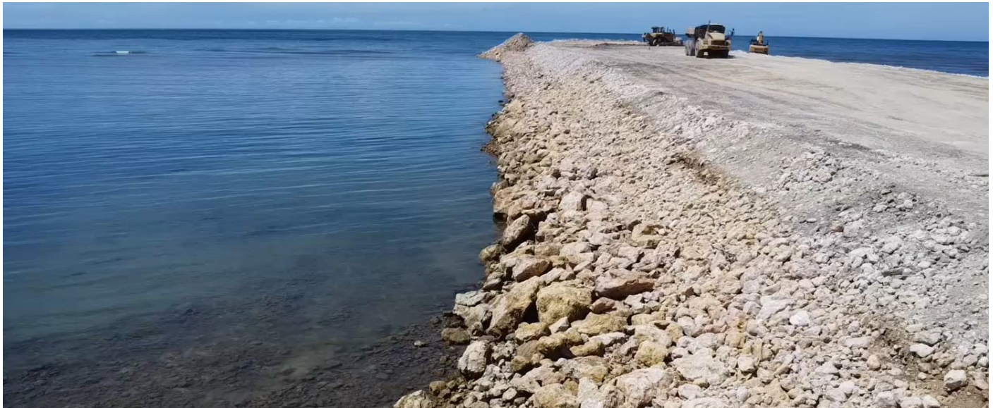
Above: Wharf completed to Stage 1 (rubble core)