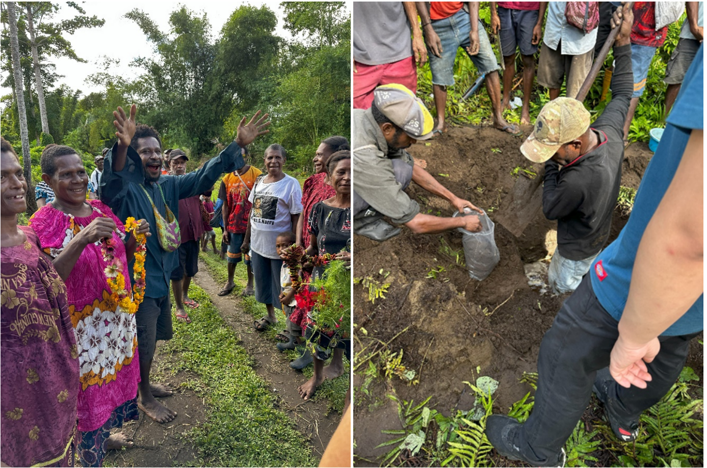
Above: Images from Mayur's site visit through the Orokolo Bay Project Area in May 2024.

Mayur was pleased to note high levels of community support in the local villages throughout the site visit.