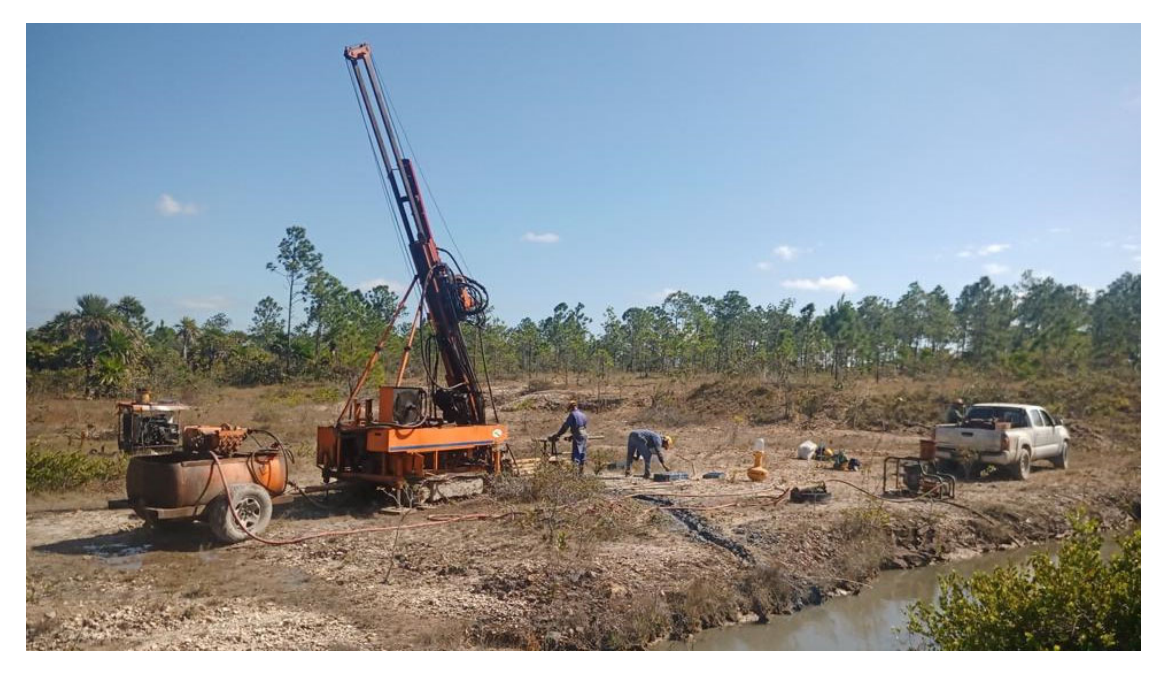
Drilling - El Pilar