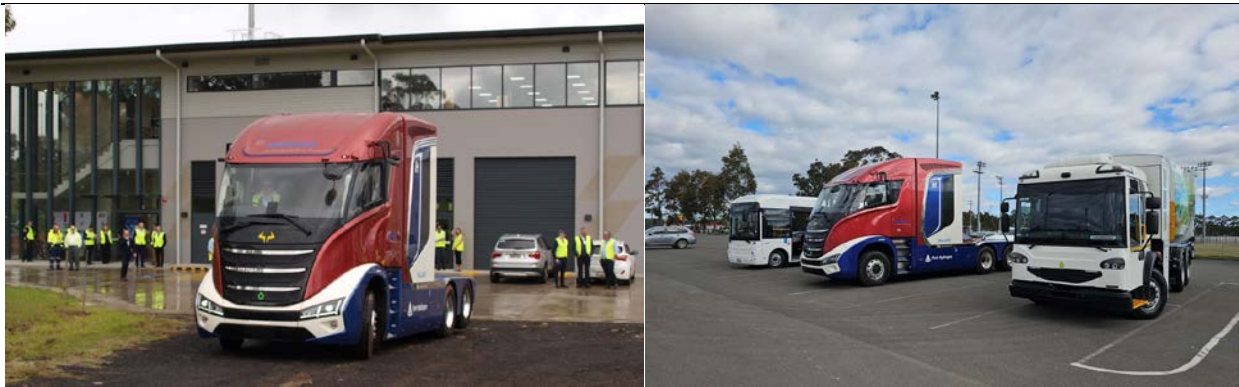
Image 4 and 5: Drive Day at Sydney Motorsport Park on 8 May 2024 and Blacktown International Sports Park on 17 July 2024, respectively