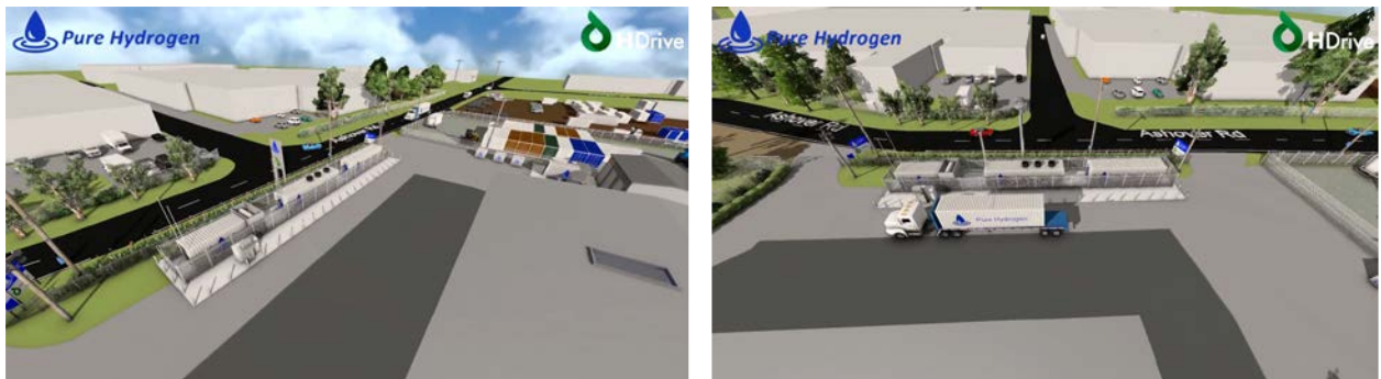
Image 2 and 3: Pure Hydrogen's first micro-hub refuelling site at Archerfield Airport – elevated view and view on to Ashover Road respectively

Planning works have commenced for the Archerfield micro-hub to be developed in stages. Stage 1 is based on initially utilising 1,000m 2 of the site with an anticipated output of 420kg of green hydrogen fuel per day. Scale-up will occur in future stages based on growing demand, serving selected target markets in commercial transport and the aviation industry.