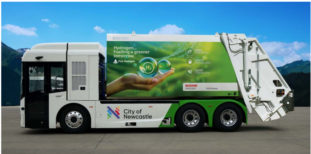
Image 1: Hydrogen Fuel Cell Garbage Truck similar to the one that City of Newcastle has ordered

During the quarter, Pure executed a Term Sheet with the City of Newcastle to supply a rear-loading HFC waste collection vehicle. The Term Sheet sets out the framework for the City of Newcastle to lease the vehicle and conduct a 12-month trial with the option of a four-year extension.