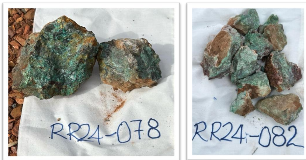
Figure 2. Examples of rock chips taken for copper mineralisation at the Stanley Copper Prospect.

Five rock chip samples of malachite rich schist and quartz veining were taken across the prospect (Figure 2).