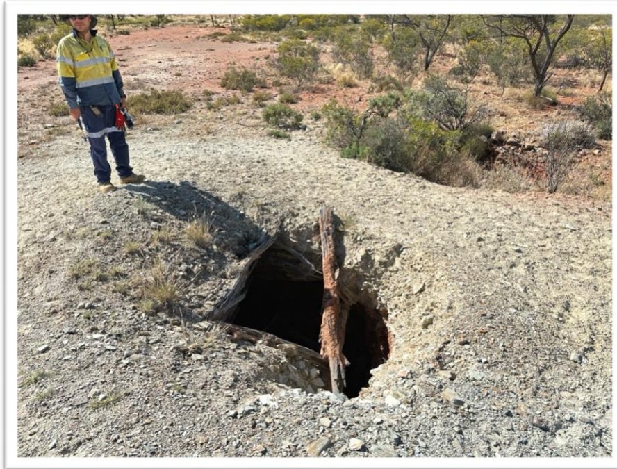
Figure 3. Historical mine shaft at the Pine Hill Gold-Copper Prospect.