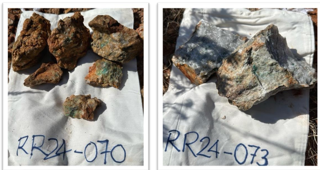
Figure 4. Example of rock chips taken from the Pine Hill Gold-Copper Prospect.