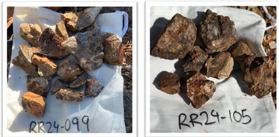
Figure 6. Examples of rock chips taken for gold mineralisation at the Sabre Gold Prospect.