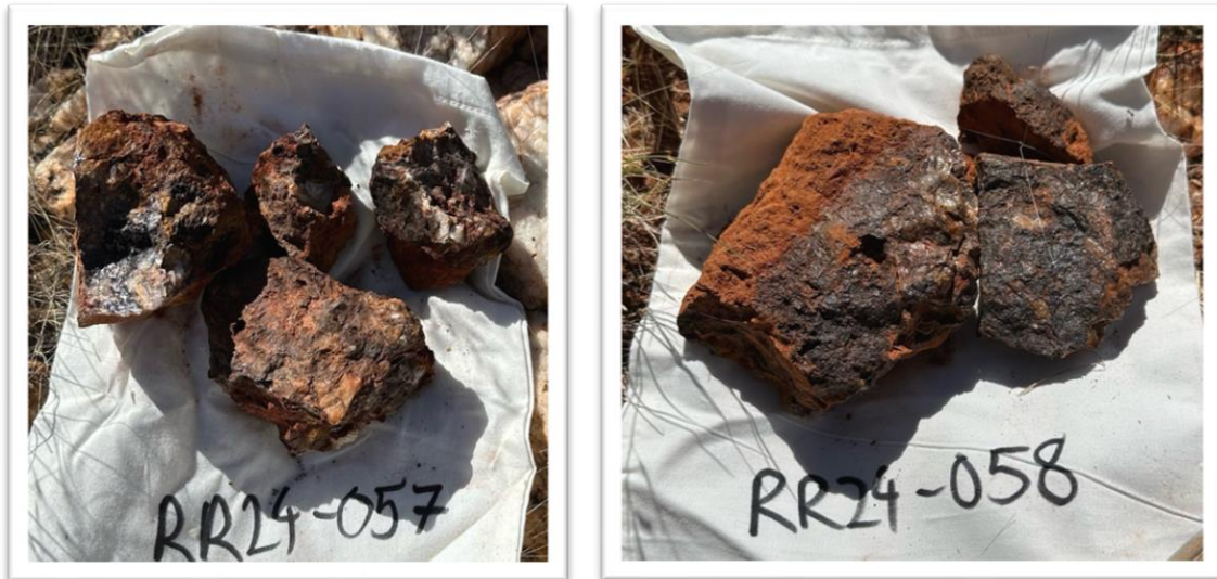
Figure 5. Rock chip samples of gossanous quartz veins from over the EM anomaly at the Scimitar Copper-Gold prospect

Three rock chip samples were taken from directly over the main Scimitar soil and 2400 siemens electromagnetic anomaly (Figure 5).