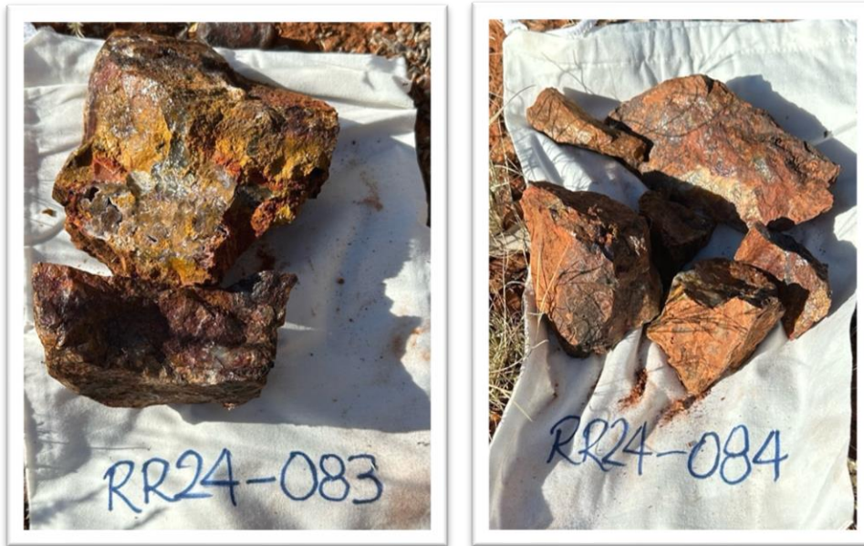
Figure 8. Examples of rock chips taken for gold mineralisation at the Trout 2 Gold Prospect.