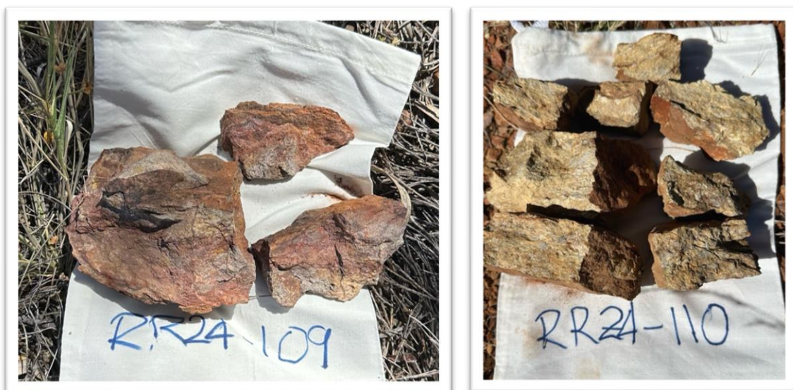
Figure 7. Examples of rock chips taken for gold mineralisation at the Falchion Gold Prospect.

Three rock chip samples were taken from the Falchion Prospect targeting mineralised altered schist (Figure 7).