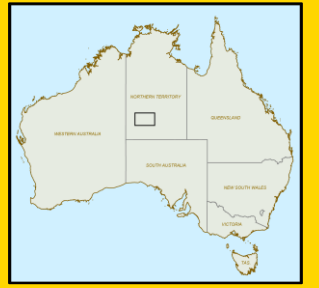
Location: Reynolds Range, Northern Territory