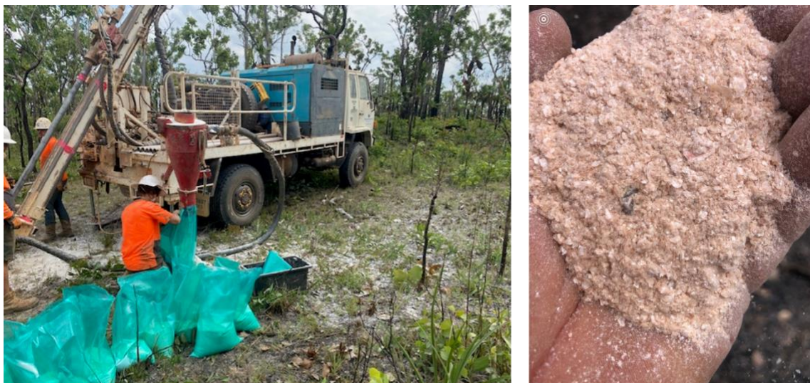
Figure 2: Bynoe Lithium Project, showing pegmatite intersected during the RAB program