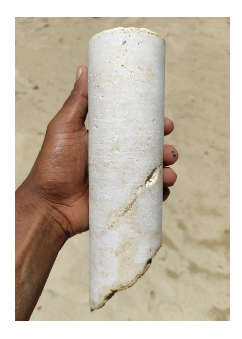
Fig 1 – High purity Soalara Limestone core

The Soalara Project is made up of two contiguous Mining Permits with a long expiry to 2055 and comprises a series of Eocene fossiliferous limestones ( Fig 1 ) that form a cliff \sim 100m high and dip shallowly at 3-5° to the west. The upper limestone is conformably underlain by a different fossiliferous limestone.