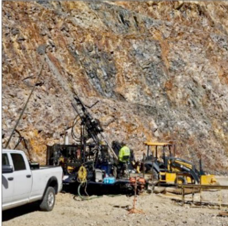
Figure 2: Company owned diamond core drill rig mobilised to the Colosseum and drilling inside the Colosseum South pit.

The Company mobilised a reverse circulation (RC) drill rig to Colosseum during the March quarter, with the first results released during the June quarter, including: