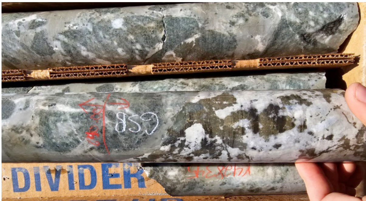
Figure 1: Sulphides in core in CM23-14