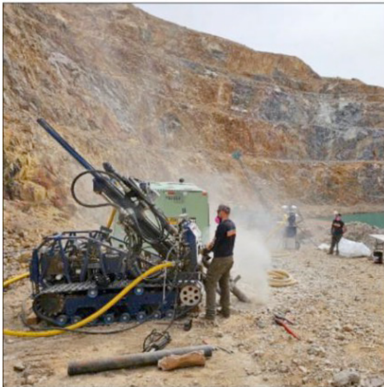
Figure 3: Company owned RC rig and compressor conducting infill drilling