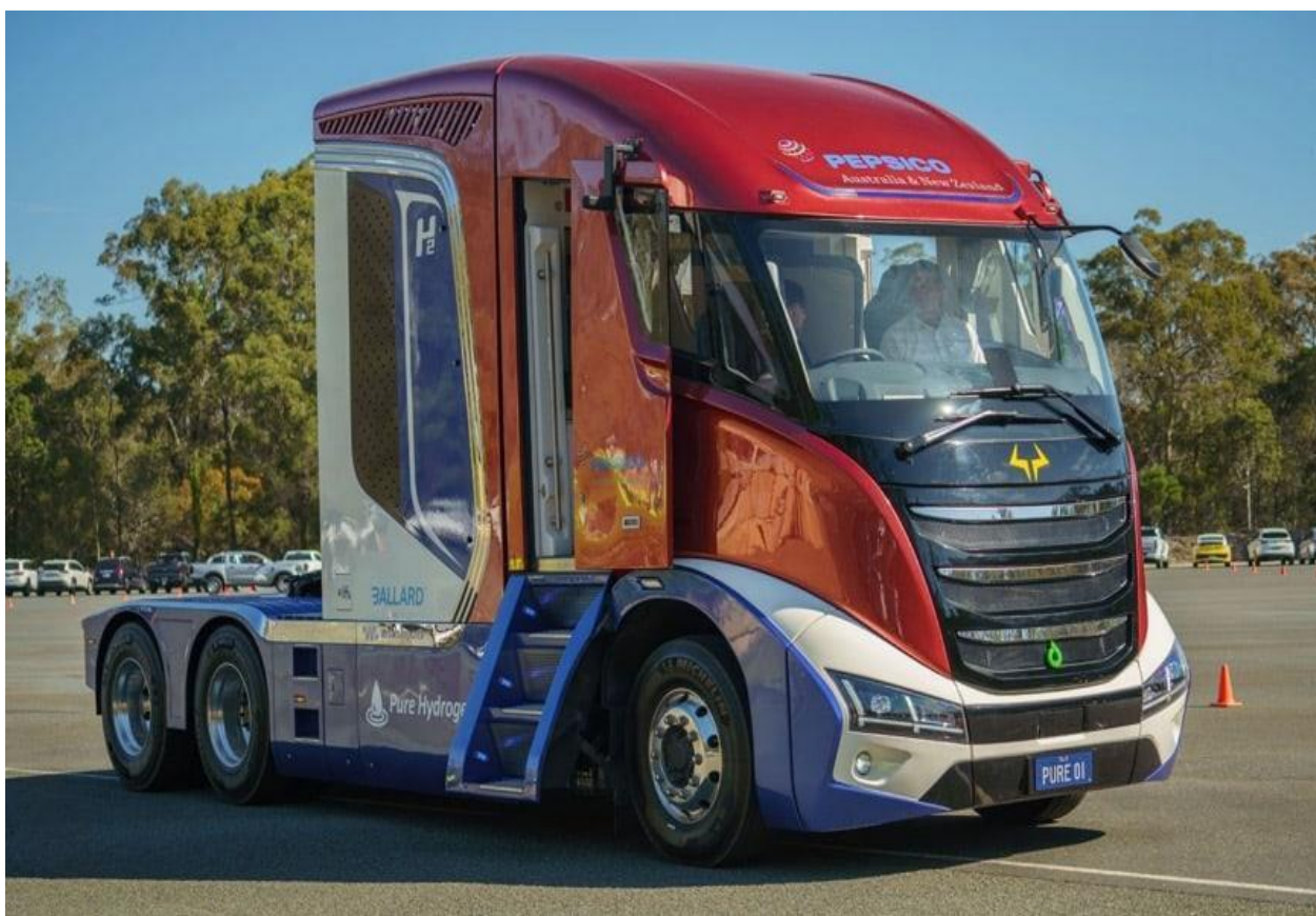
The 'Taurus' hydrogen-powered Prime Mover

Concurrently, the Company maintains a strategic interest in the development of natural gas projects in Botswana, through its investment in Botla Energy Ltd (ASX: BTE) – an energy company listed on the Australian Securities Exchange.