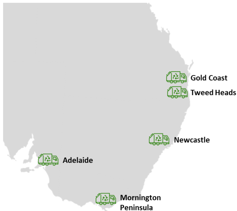
Pure Hydrogen waste truck deployment locations across Australia

The following partnerships demonstrate the Company's growing presence in the waste management sector in Australia.