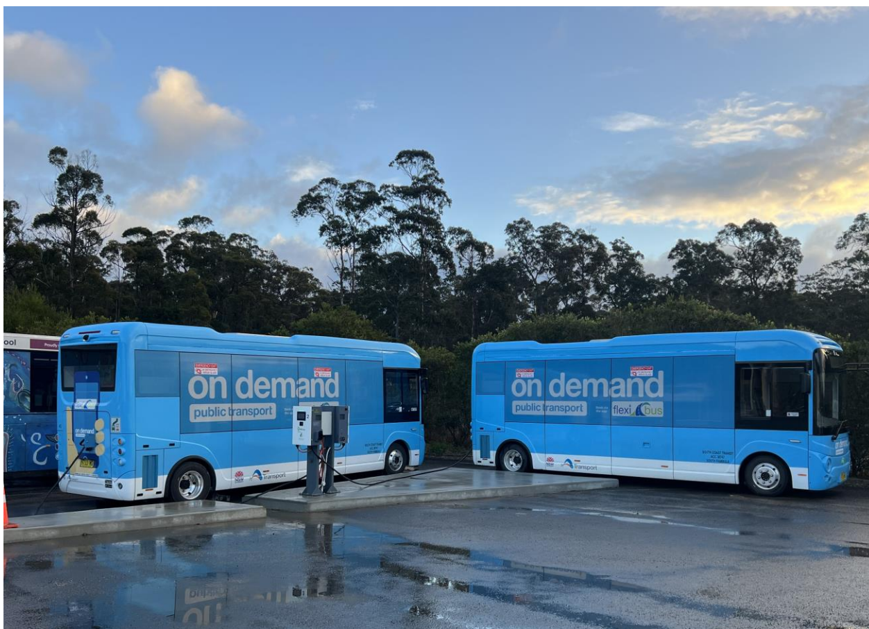
The EV70 electric minibus

Pure Hydrogen and HDrive International also exhibited at the National Bus and Coach Show held on Tuesday 17 and Wednesday 18 September 2024 at the Brisbane Convention & Exhibition Centre. The event offered a large array of products and services, featuring the latest trends in the zero-emissions, energy and infrastructure space. The show was an excellent opportunity to show case the Company's latest range of passenger vehicles and network with peers.