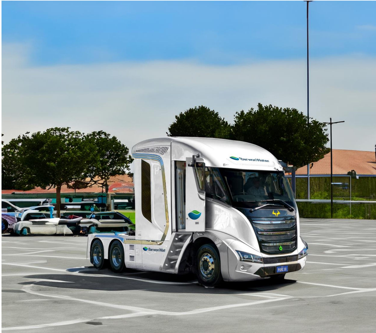
Design Image of the Barwon Water Garbage Truck