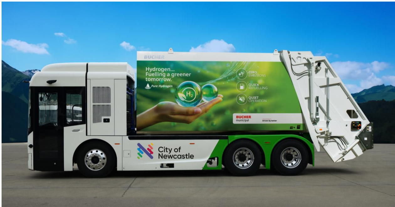
Hydrogen Fuel Cell Garbage Truck similar to the one that City of Newcastle has ordered