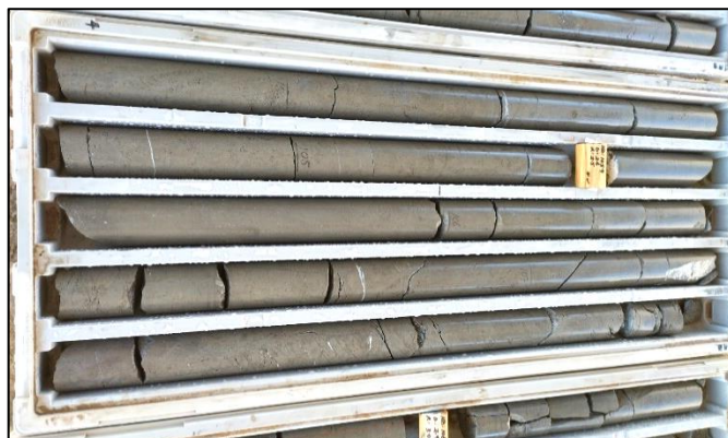
Hole PGNL005 103.7 – 107.9m: 4.2m interval of Massive Sulphide Pyrite dominant core assaying 4.2% lead, 9.10% zinc, 449g/t silver, 0.97g/t gold and 0.09% copper.