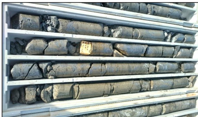
Hole PGNL003 113.1 – 116.5m: 3.4m interval of Massive Sulphide Pyrite dominant core assaying 17.2% lead, 7.4% zinc, 463g/t silver, 0.94g/t gold and 0.1% copper.