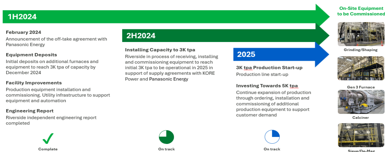
Figure 3 Path to commercial production at Riverside