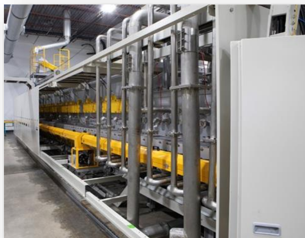
Figure 4 NOVONIX Cathode Pilot Line, Nova Scotia, Canada. 13.5 m long roller hearth kiln (RHK)

CBMM has invested US$80 million in establishing its first industrial-scale niobium oxide refining facility with the intent of providing battery makers with niobium. The facility is focused on niobium oxide applications for battery materials. The use of niobium oxide has been shown to improve the cycle life of NMC cathode materials, and it is expected to be a key material in CAM production. Before the end of 2024, CBMM aims to complete its first production from the 3,000 tpa facility.