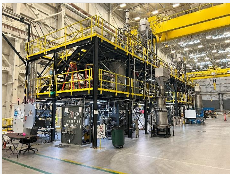
Figure 1 NOVONIX Riverside Facility, Chattanooga, Tennessee

US$9.0 million in reimbursements from the DOE MESC grant for the nine-months ended 30 September 2024, and previously released unit economics ( below ).