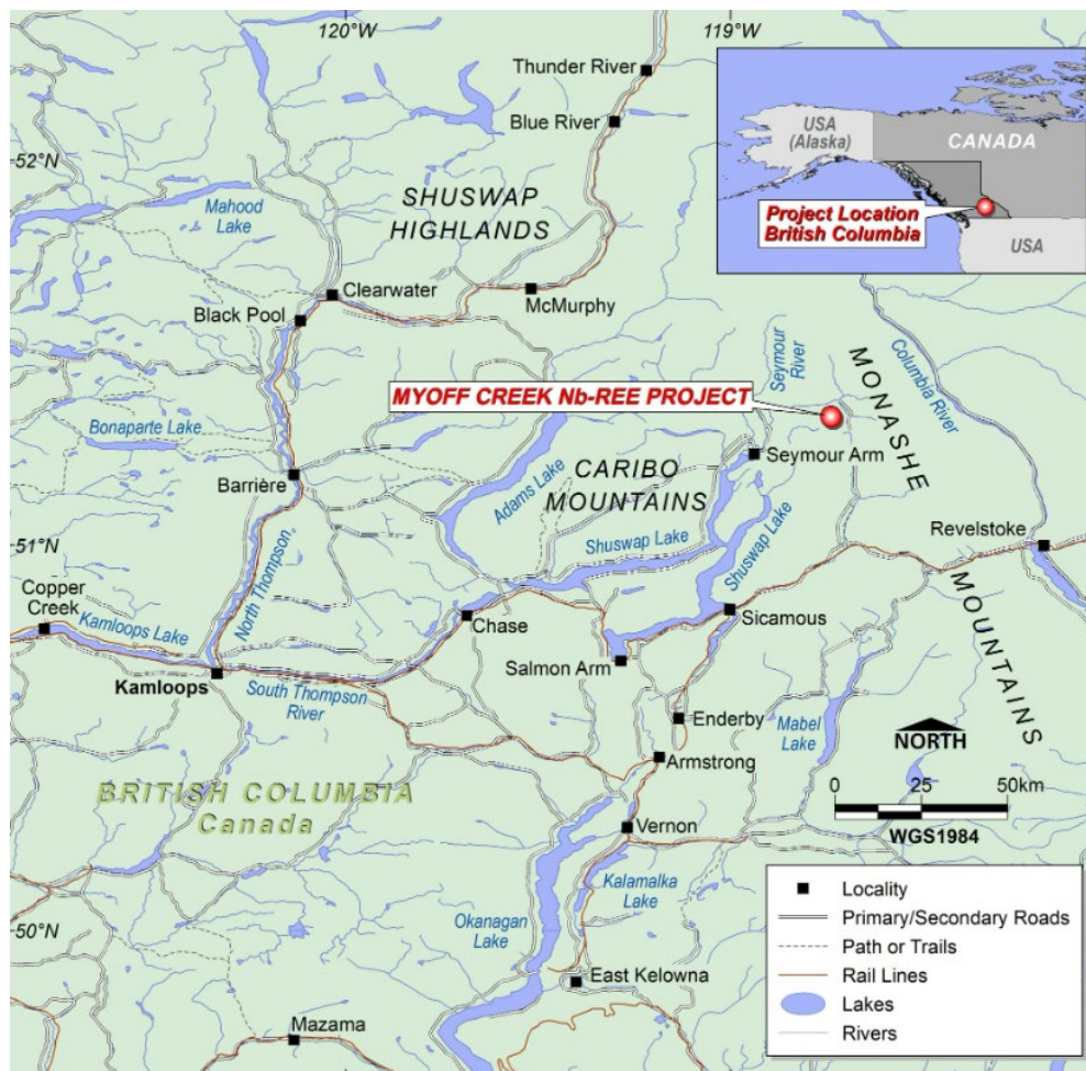
Figure 1 – Myoff Creek Project location