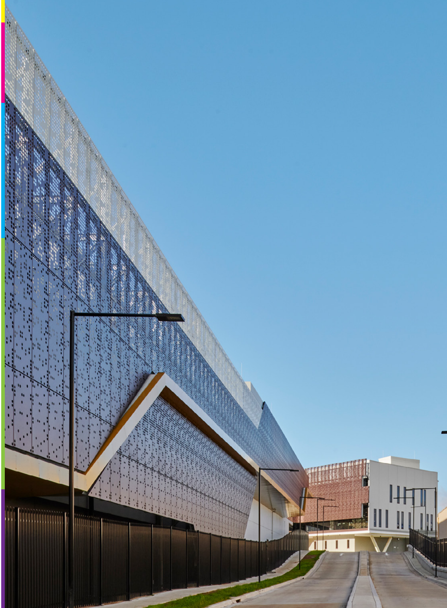
CDC Hume Campus