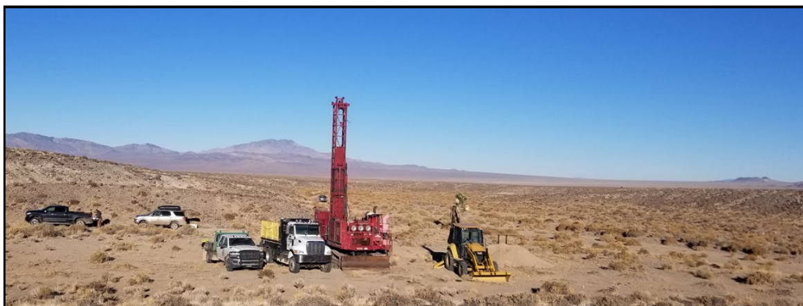
Figure 3. TRACK MOUNTED RC DRILL RIG ON SITE AT ALKALI FLATS

During the quarter, a total of 8 drill holes of the 14 holes planned at the Alkali Flats project were completed for a total of approximately 1,295.5 metres. Table 1 is a list of the drill holes completed and their coordinates using NAD 83 Zone 11 datum.