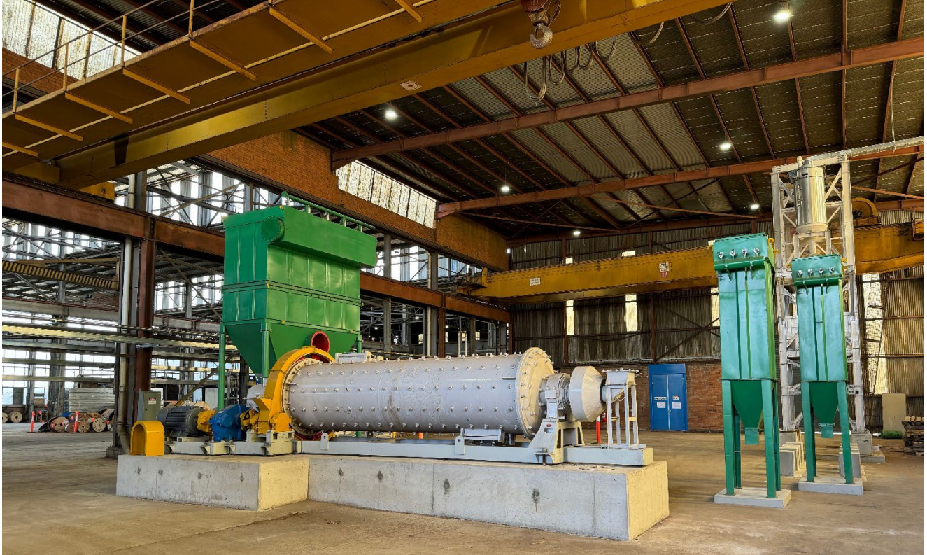
Figure: Briquette civil work completed with major equipment set in position on foundations