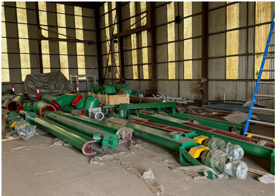
Figure: Remaining major equipment received for Briquetting including hopper, ducting, and piping