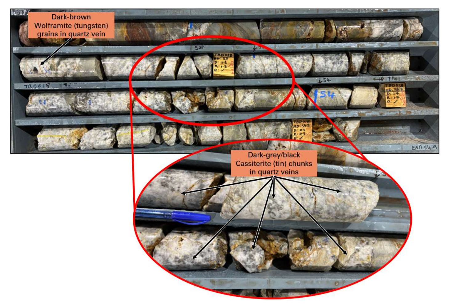
Figure 2: Top: Photo of HQ drill core in core trays from diamond drill-hole TBD018 with wide quartz-cassiterite (tin) veining shown between ~51.6m-54.9m and wolframite (tungsten) grains. Bottom insert: Magnification of the strongly mineralised vein at ~53m and 53.8m where abundant, large cassiterite (tin) chunks are visible in the core as dark grey/brown/black zones in quartz and iron-oxide veins. NB: Cassiterite is 78.7% tin – assays are pending.

In relation to the disclosure of visual mineralisation, the Company cautions that visual estimates of mineral abundance should never be considered a proxy or substitute for laboratory analyses where concentrations or grades are the factor of principal economic interest. Visual estimates also potentially provide no information regarding impurities or deleterious physical properties relevant to valuations. The Company will update the market when laboratory analytical results become available, expected during March 2025.