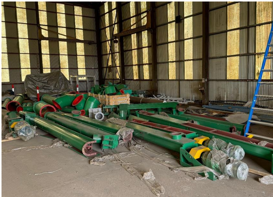
Figure: Remaining major equipment received for Briquetting including hopper, ducting, and piping