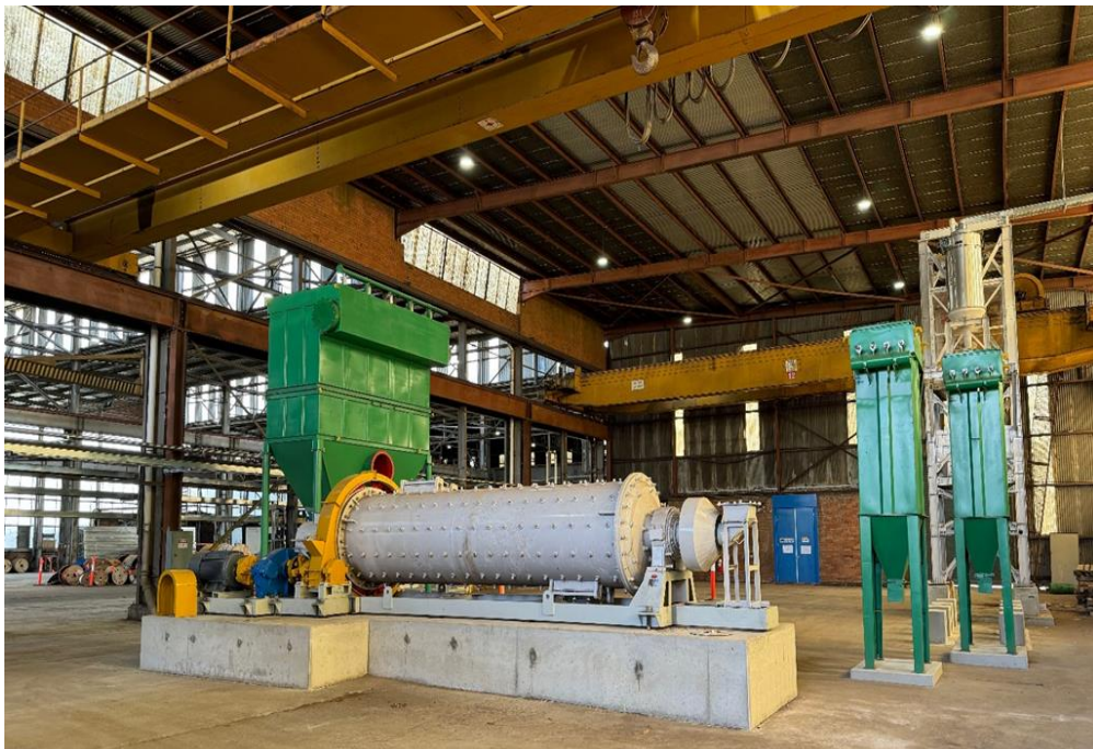
Figure: Spray Roaster reactor vessel insulation works completed