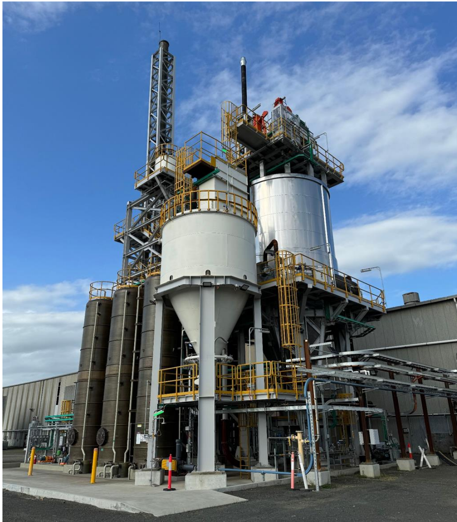
Figure: Spray Roaster reactor vessel insulation works completed

All construction and early commissioning activities related to MgO production were successfully completed towards the end of Q3 2024, including all upgrades to improve plant operability that were identified from the initial commissioning.