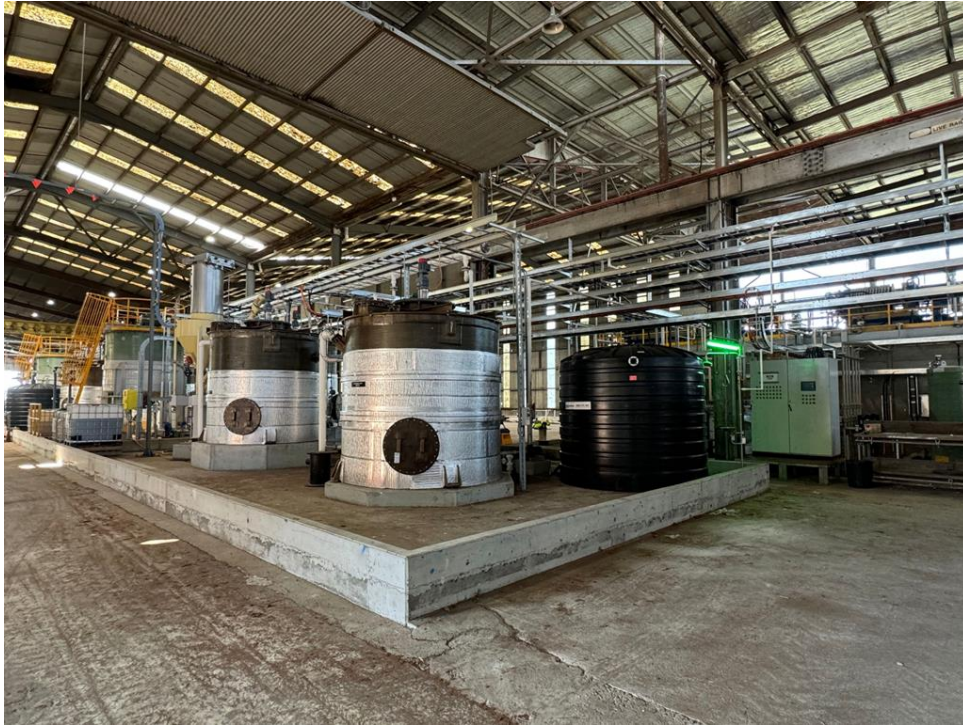
Figure: Hydromet piping modifications and installation new surplus capacity tanks completed