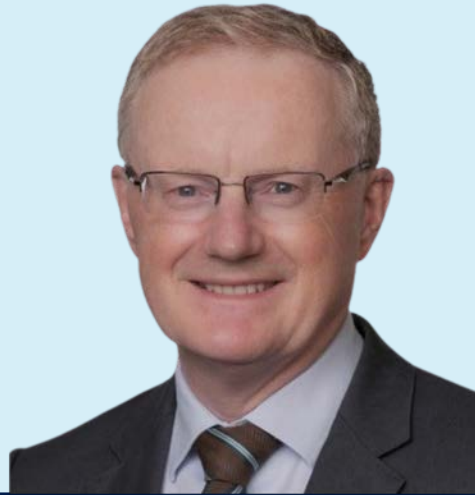
Dr Philip Lowe