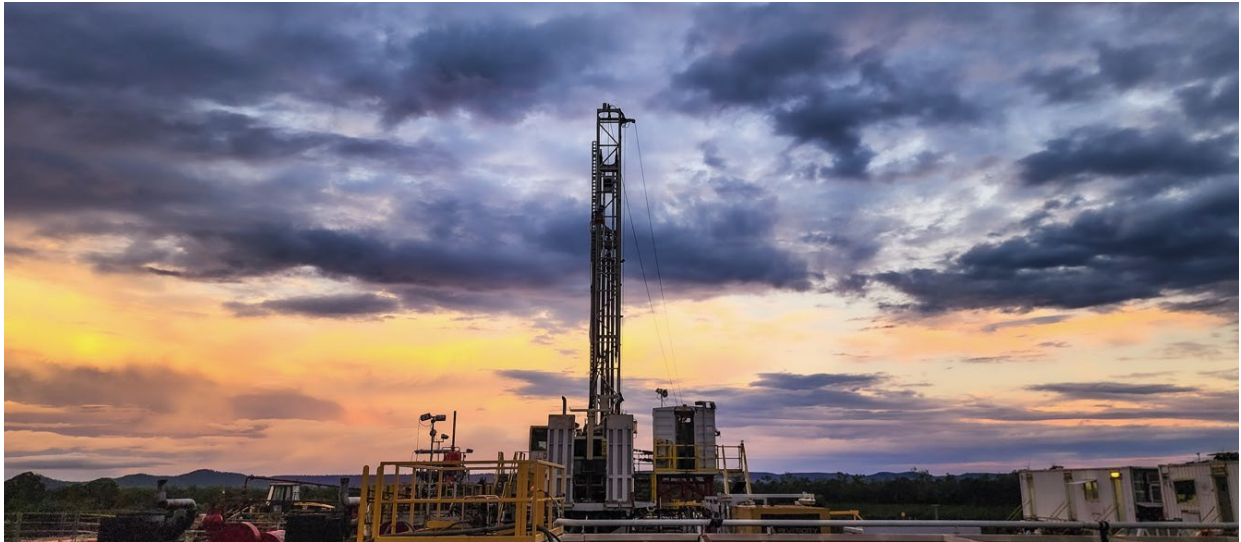
Figure 1: Silver City Drilling Rig 34 drilling ahead at State Gas Rougemont 6