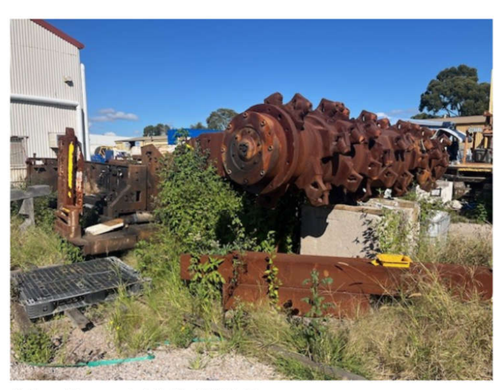
Continuous Miner pre overhaul, Kurri Kurri (NSW) facility.