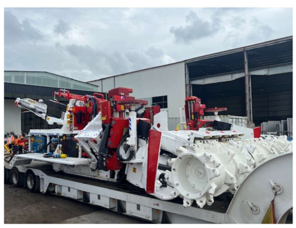
Continuous Miner post overhaul and ready for delivery to Malabar, Kurri Kurri (NSW) facility.