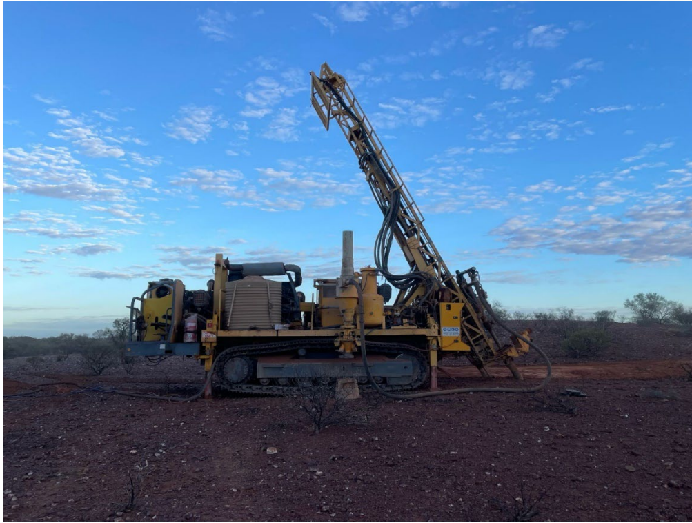
Figure 2: RC Drill Rig in action at the Ashburton Gold Copper Project

Subsequent to the end of the quarter the Company commenced a maiden RC drill program at the Ashburton Project. The drilling program comprised of 21 holes for ~1,400m and tested approximately 1km of strike potential at Donnelly's at depths of up to 150m, in an attempt to demonstrate both lateral and down-dip continuity of mineralisation.