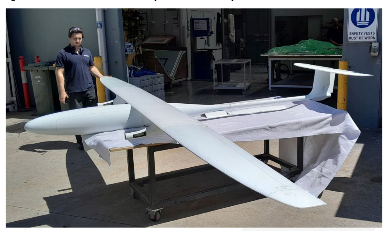
Image 1: Completed Pegasus I Airframe designed and built by EATP partner V-TOL Aerospace

The Pegasus I project exemplifies a significant advancement in sustainable aviation technology, highlighting the considerable sovereign capabilities of Australian innovation across battery cell manufacturing, advanced solar and UAV technologies for a product that could have broad commercial applications across the defence, mining, communication and agricultural sectors, both domestically and internationally.