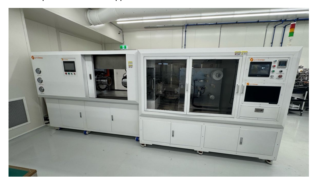
Image 2: Lithium Foil Extruder installed at Li-S' Phase 3 Facility in Geelong

The Company expects to commission the line after operator training is completed in late May, with the first lithium metal foils expected to be produced before the end of June. This foil will be of a specification suitable for incorporation directly into the lithium-sulfur cell manufacturing line while we explore commercial opportunities for sale of the foils.