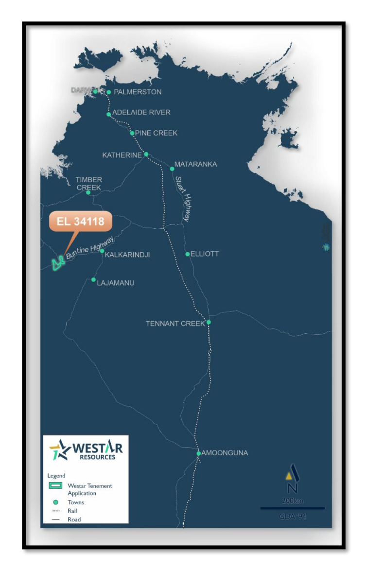
Figure 1. Location of EL34118 (application).