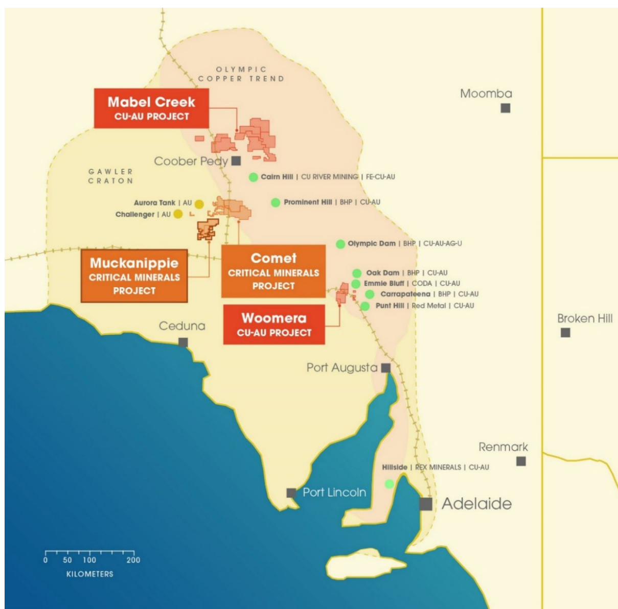
PTR's Project Locations in South Australia

The Company also has two major exploration projects in the world-class Olympic Copper-Gold Province of South Australia. Work in the region has uncovered Iron-Oxide Copper-Gold style alteration/mineralisation at both its Mabel Creek and Woomera Project Areas. Geophysical targeting work has defined several compelling Tier-1 Copper-Gold targets which are drill ready.