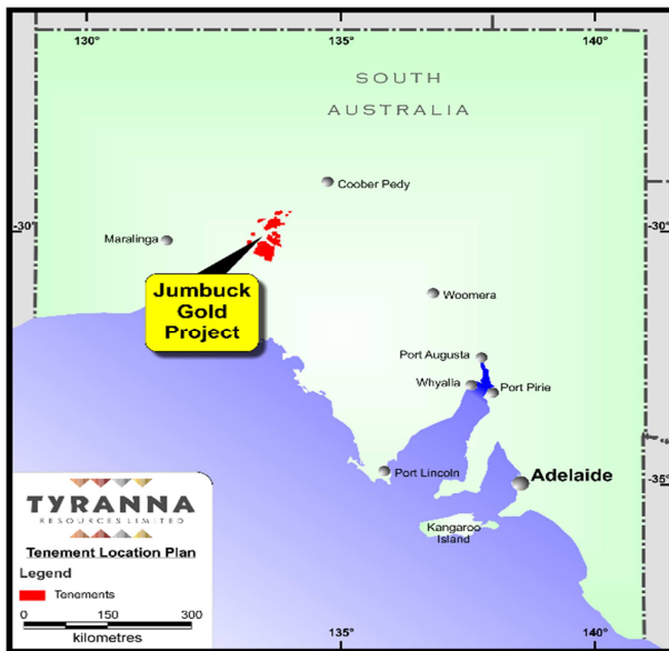
Figure 2: Location map of Jumbuck Gold project