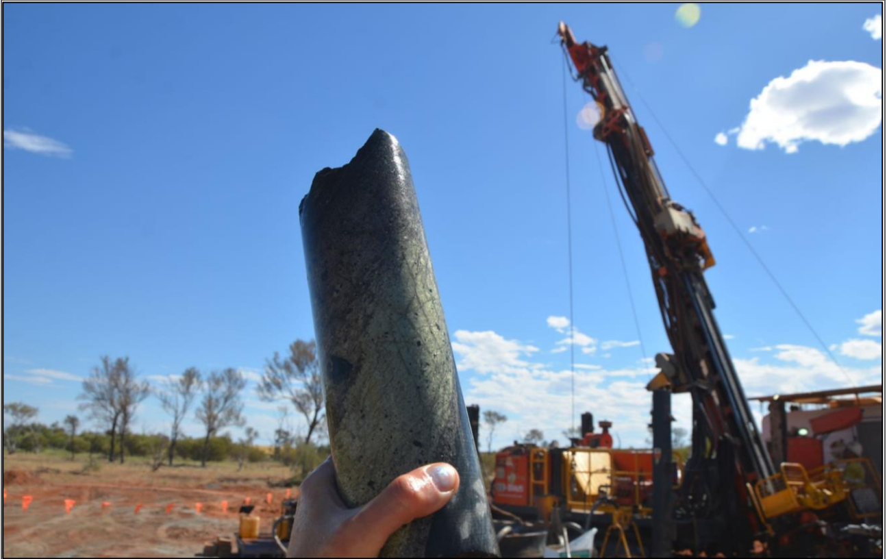
Image 1: Copper sulphides intersected in Babel Metallurgical drilling.