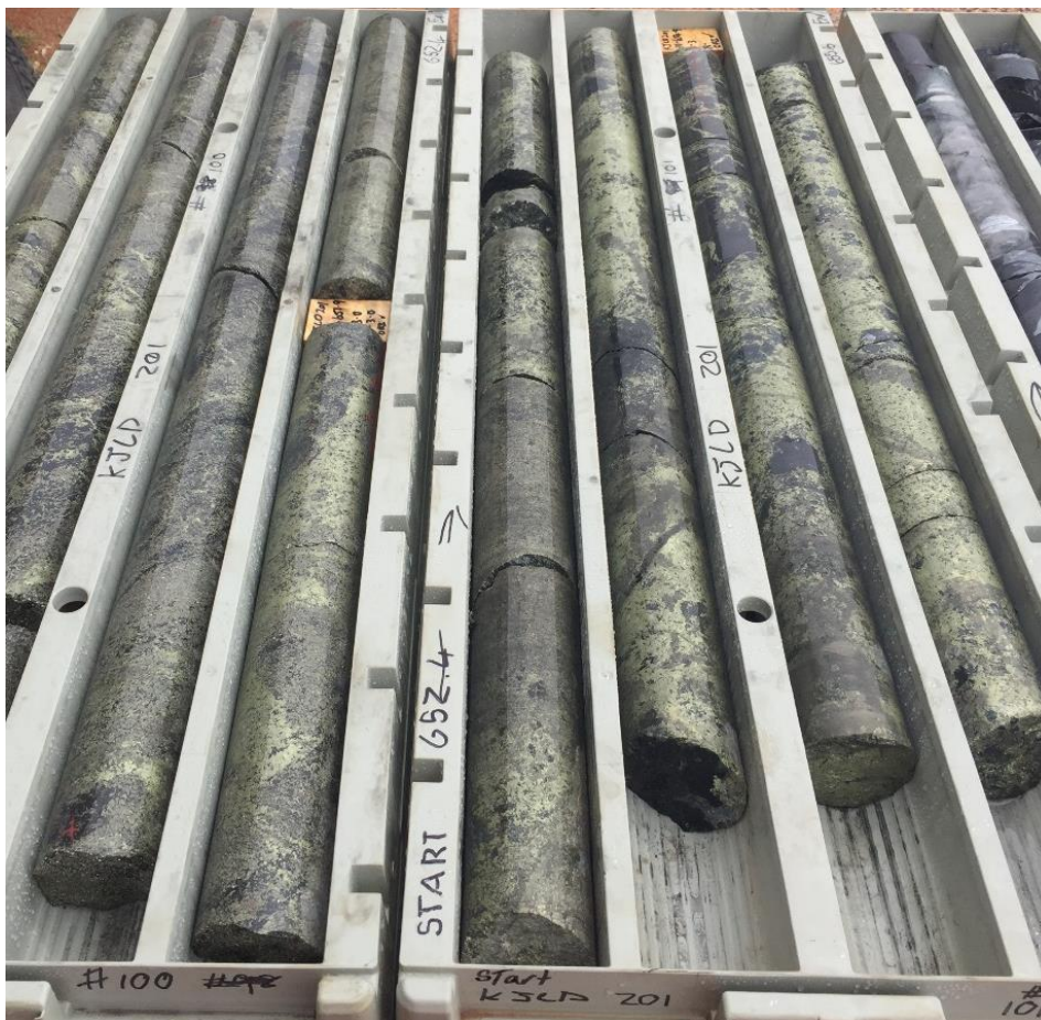
Figure 2. Mineralised core from KJCD201 (circa 653m)