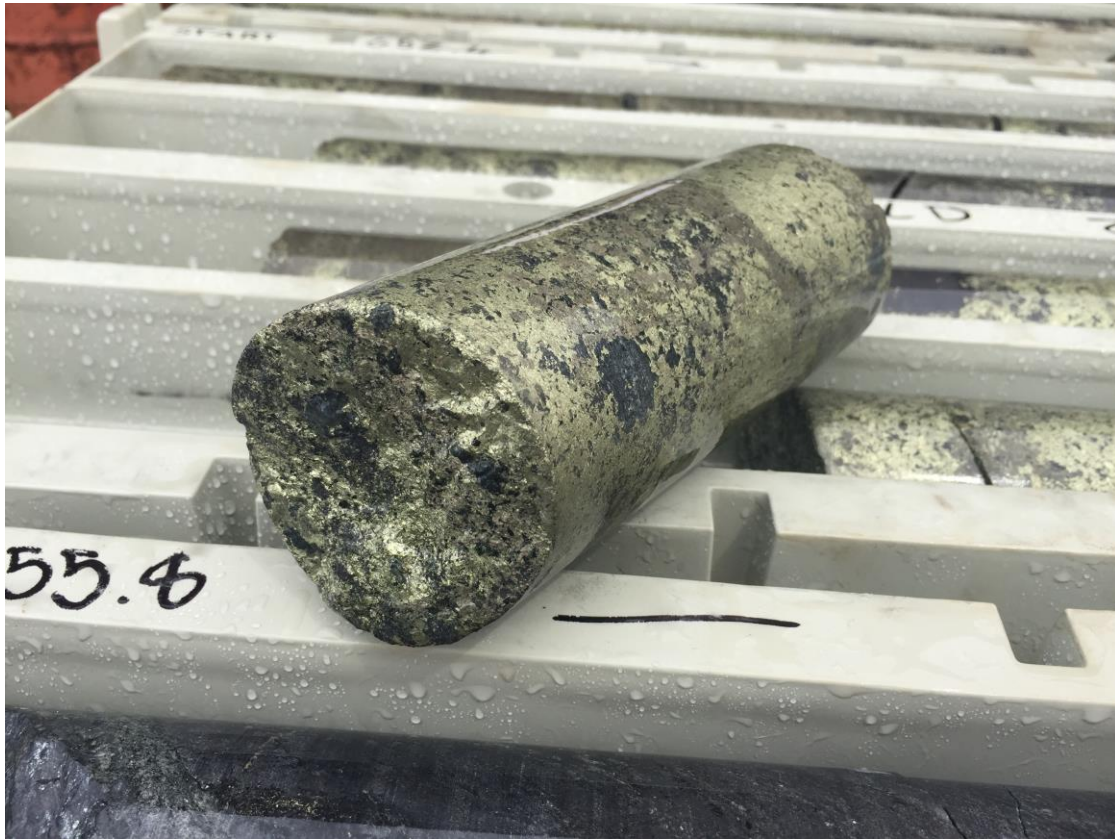
Figure 1. Mineralised core from K JCD201 (circa 655m)