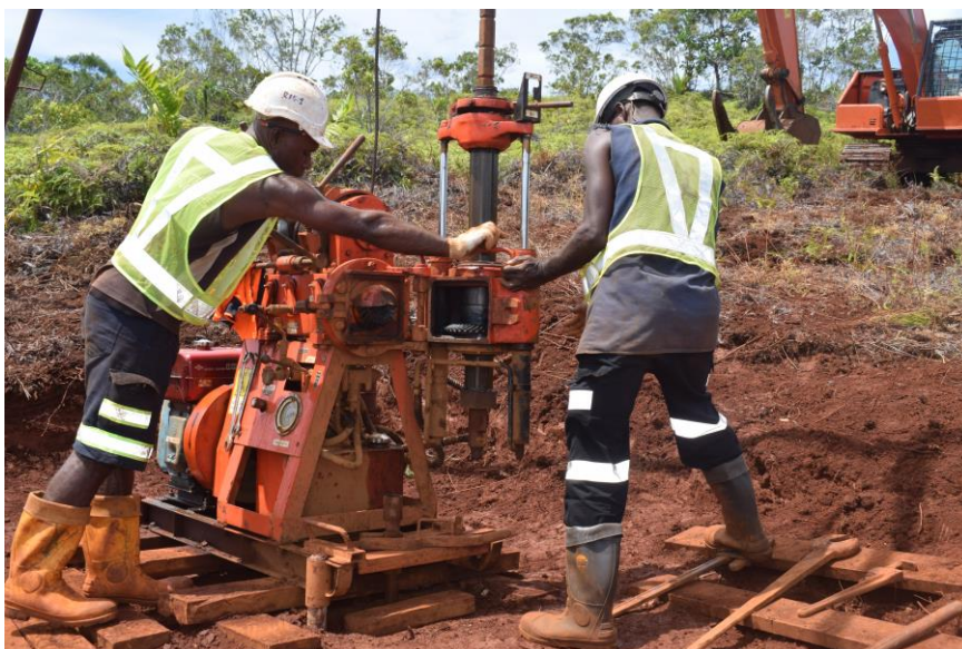
Figure 1 Drilling operations

Axiom CEO Ryan Mount said, "We continue to be pleased with the drilling results. These results, coupled with our drive to refine our business to ensure a far more efficient operation in Solomon Islands, put us in a strong position to be able to provide a premium product to the nickel ore market in 2017."