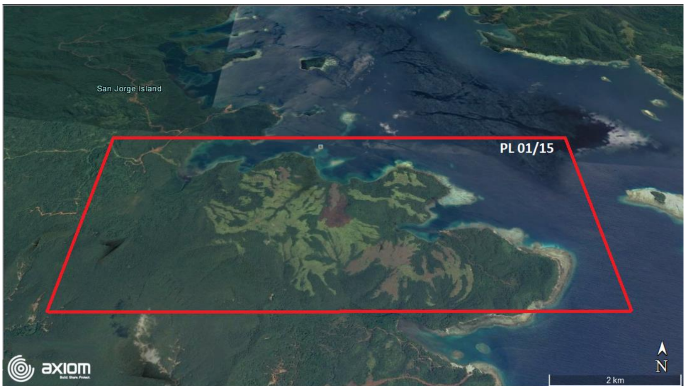
Figure 2 San Jorge drilling location overview

The project location is indicated in Figure 2, with drilling details provided in Figure 3.