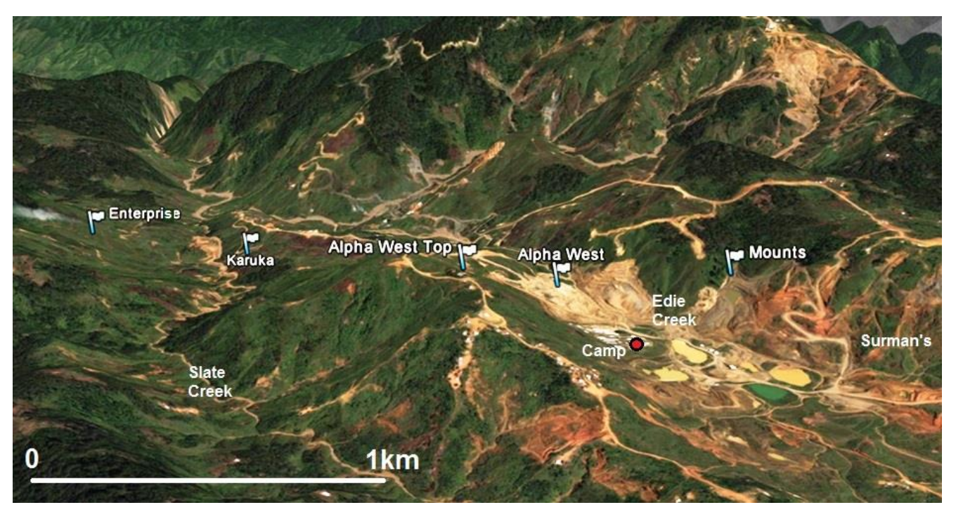
Figure 1: Edie Creek oblique Google Earth view showing location of infrastructure, vein systems and main targets.