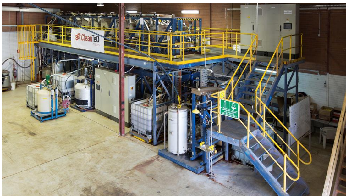
Figure 1: Clean TeQ's Proprietary Resin-In-Pulp (cRiP) Pilot Plant

The pilot campaign successfully processed a bulk sample of approximately 20 tonnes of Syerston ore to produce a batch of high purity nickel and cobalt sulphate eluate solution (see Figure 2 below). This solution is currently being further refined into samples of high purity nickel sulphate and cobalt sulphate which will be sent to potential offtake customers in the first quarter of 2017 for product testing and qualification.