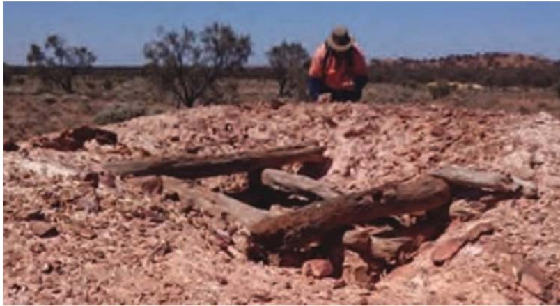
Figure 1 – Historic workings at the 'Natasha' prospect, Ironstone Well.