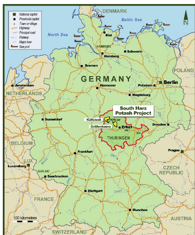
Figure 1 Location of Davenport projects

The German potash licences, Küllstedt and Gräfentonna (Fig 1) cover approximately 450 km 2 within the South Harz potash basin, a region of historic potash production in central Germany.