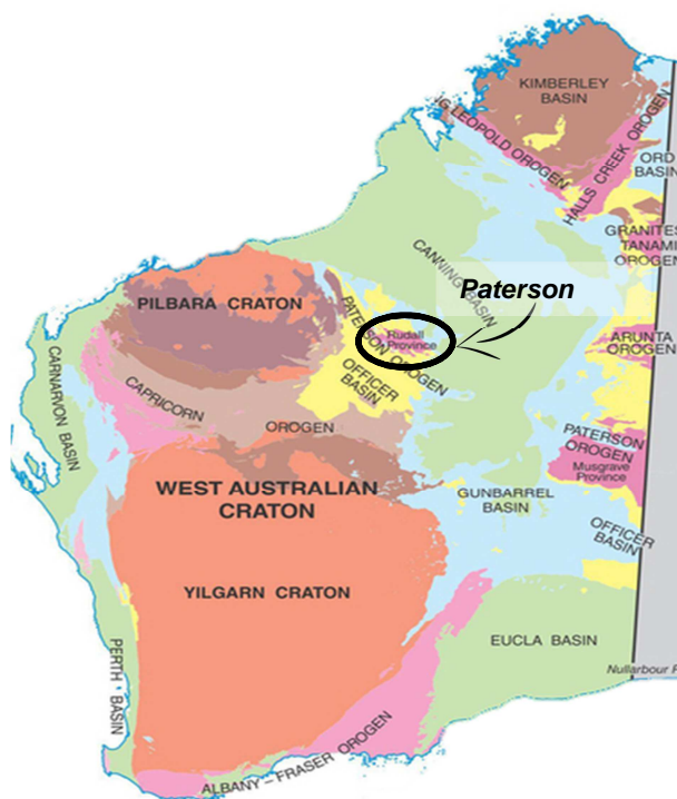
Figure 1 Paterson Province Projects Location Map

Exploration activities have commenced with the acquisition of samples and data previously acquired by a third party, the assessment of which will inform and shape our exploration work program for the Sunday Creek project.