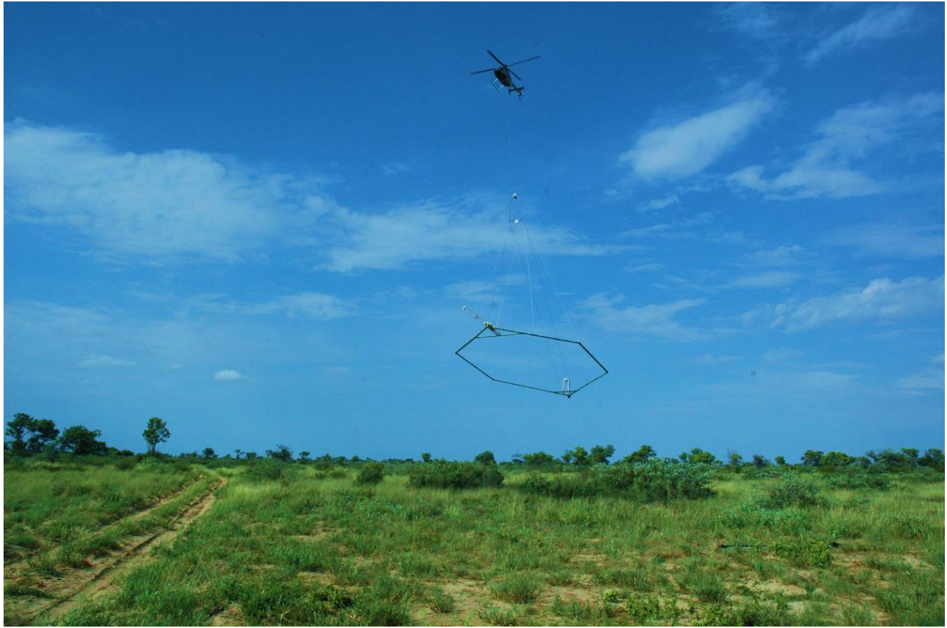
Figure 2: The SkyTEM technology during survey operation (not on Orion projects).

"Orion has a rare opportunity to enhance the value of its Northern Cape projects by simultaneously progressing advanced and early stage projects. The Company's primary focus is to continue resource delineation drilling at the advanced Prieska Project, followed by drill testing of known nearby mineralisation. In addition, we have decided to undertake target generation activity to identify high priority drill targets for follow-up, with the objective of new discoveries becoming satellite operations to a potential Prieska Project production centre at Copperton"