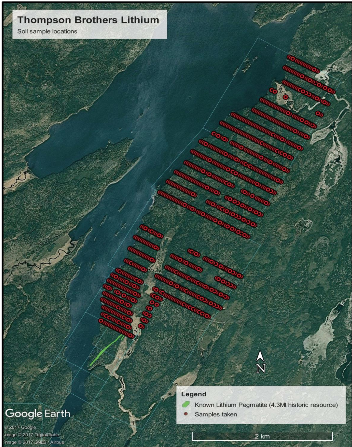
Figure 2. Soil sample locations

The detailed fieldwork undertaken throughout 2017 with a total of 978 samples taken will further define further drill targets and pegmatite extensions (Figure 2). The company is expecting to receive the results of these samples shortly.