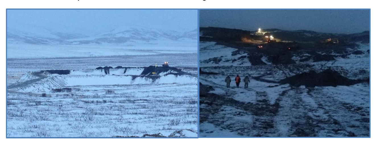
Constructing sedimentation ponds