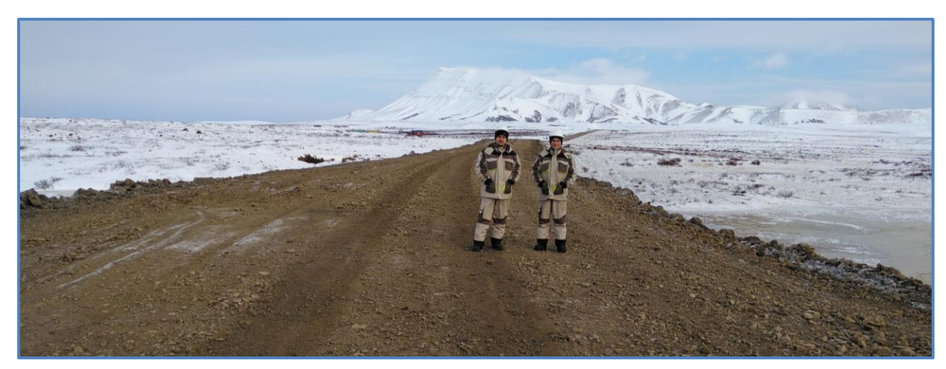
The haul road prior to recommencement of coal haulage in December