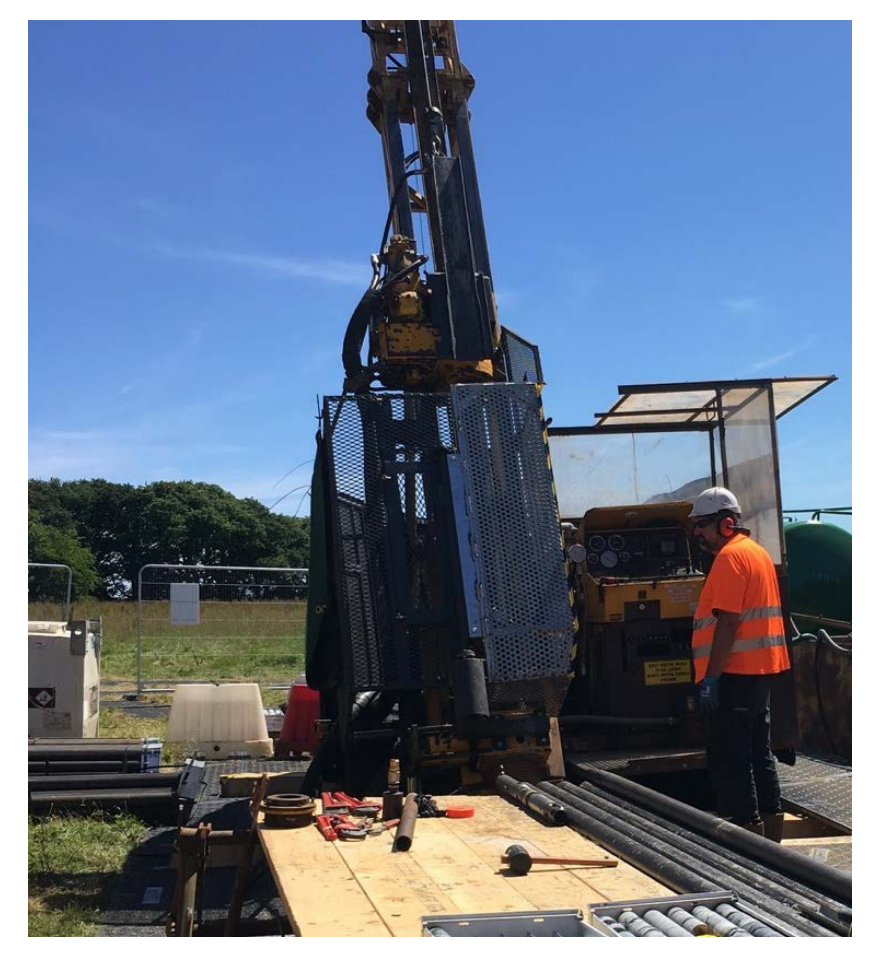
Drilling at Redmoor – 22 June 2018