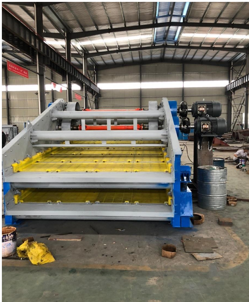
Figure 2: High frequency vibrating screen