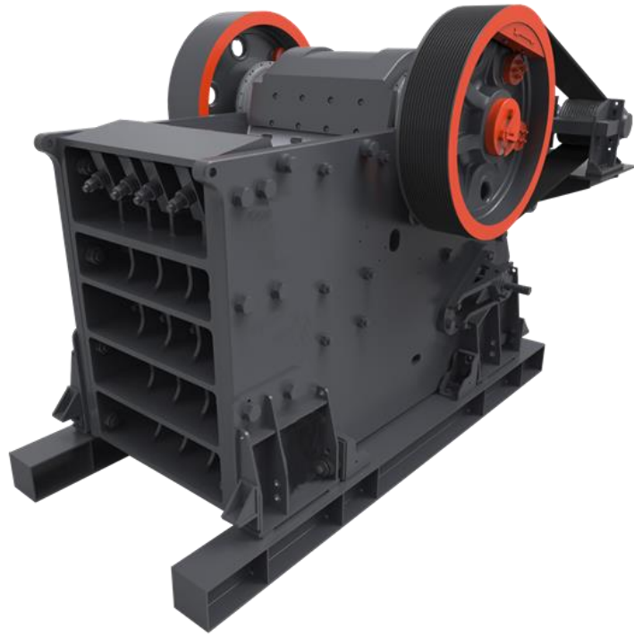
Figure 4: Jaw crusher to be installed shortly at Merlin Diamond Mine