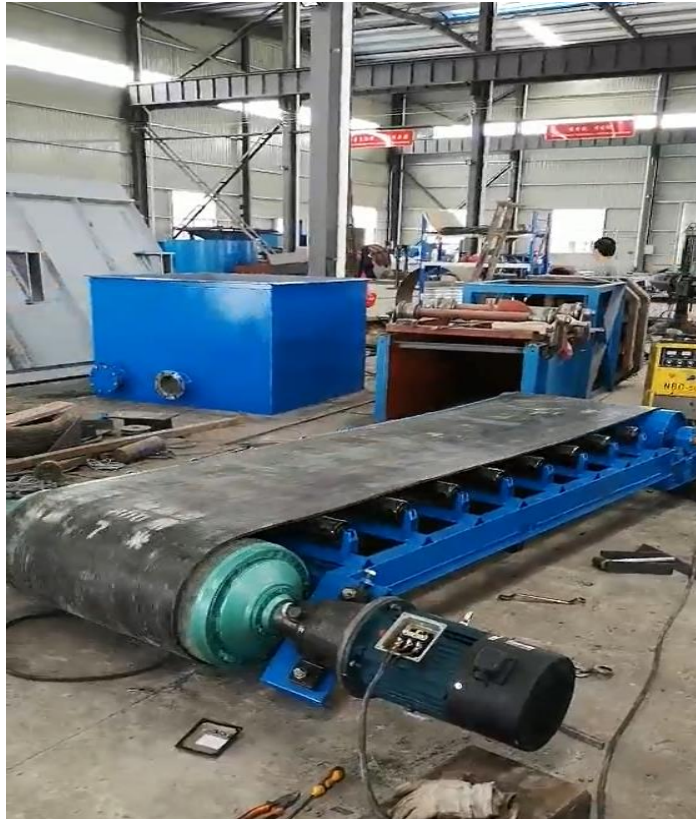
Figure 3: Conveyor belt