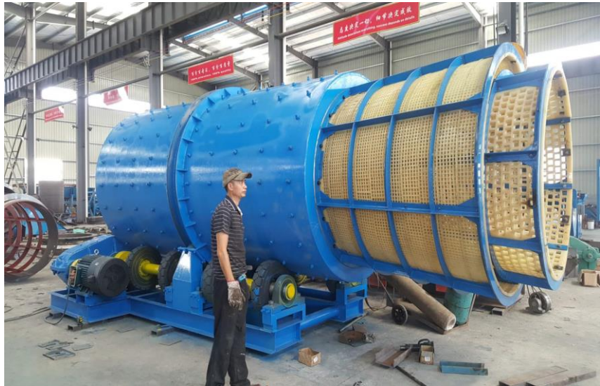
Figure 1: Trommel scrubber washing plant