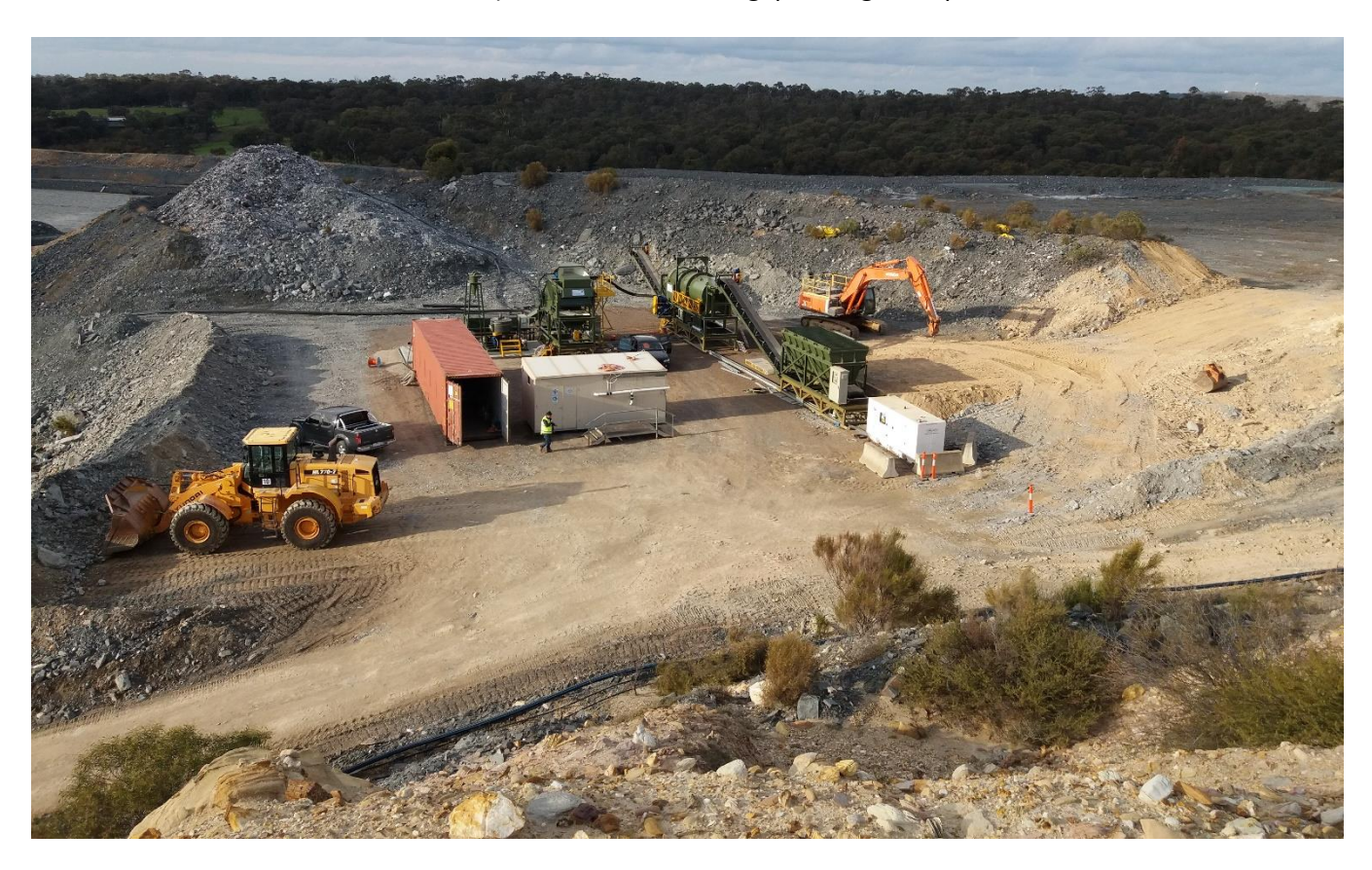
Figure 1: Kangaroo Flat Coarse Sand Dam Processing Equipment

As reported in the September 2017 Quarterly Report, GBM has an agreement with Gold Miners Australia (GMA) to jointly mine and process the sand in the Kangaroo Flat Coarse Sand Dam. The wash plant and 2x30tph gold concentrators to recover the contained gold and sulphides have been installed and are ready for commissioning (see Figure 1).