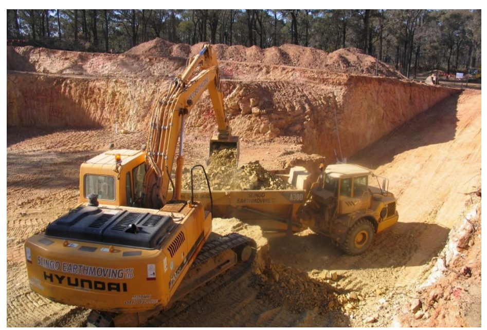
Figure 3: Excavating Bulk Sample Pit at Harvest Home

GBM has received approval to implement a production pit that will encompass and extend the existing bulk-sample pit. Approximately 44,000 tonnes of ore at an estimated grade of 2.46g/t will be excavated in the next phase of the operation. In addition, a selective program of costeaning and in-fill drilling will build resource potential at Harvest Home and other prospects on the tenement. Mining will be conventional drill & blast utilising hydraulic excavator and articulated trucks. Ore will be transferred to an offsite processing facility.