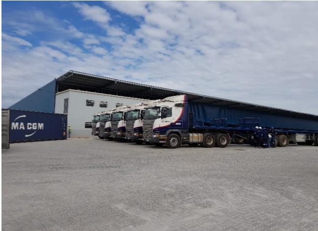
Contractor new dedicated trucks