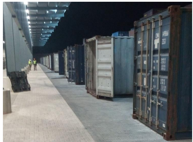
CDF 24 hour operational capability