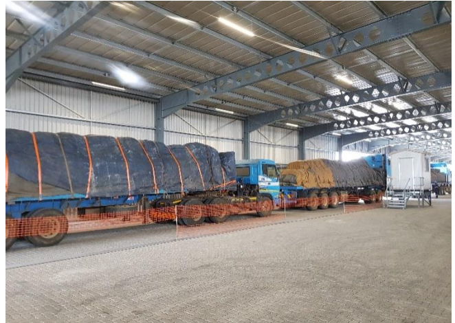
Graphite product to be unloaded