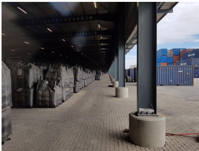
Graphite inventory to be loaded into shipping containers