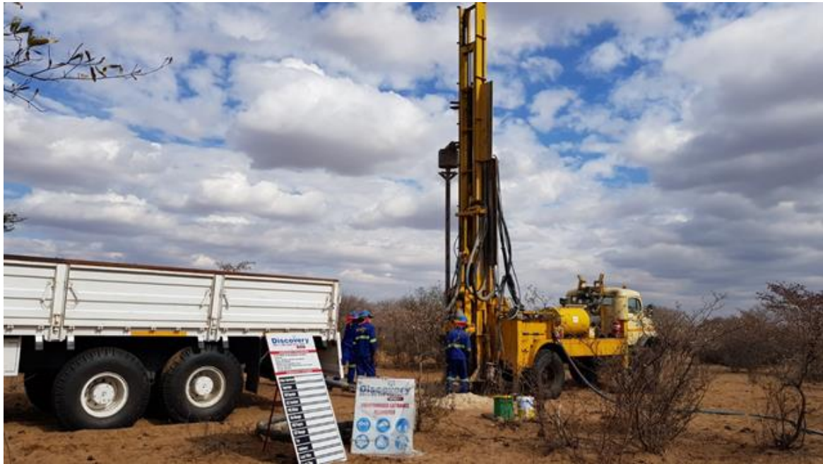
Plate 1 - KM3 Maiden Drilling Program Drill Site KM3_RC001