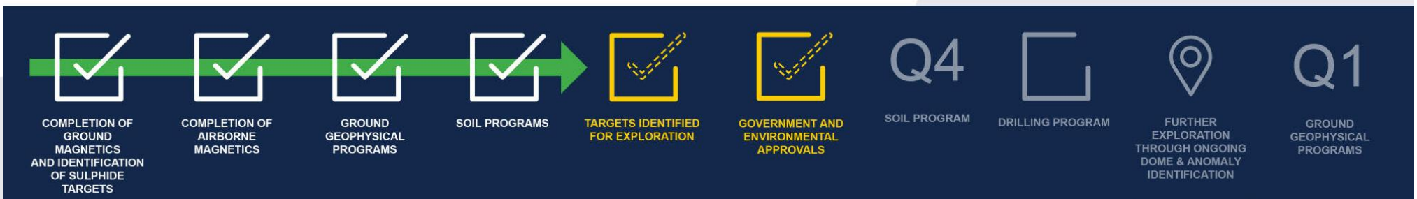
Figure 2. Namibia/Botswana Project Timeline

HISTORICAL GOVERNMENT DEPT. DATA PROVIDES FAST-TRACKS PROJECT TIMELINE