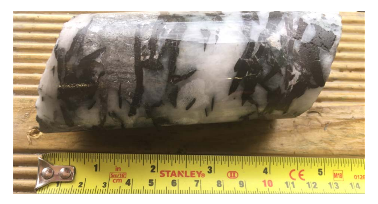
Well-developed wolframite in SVS quartz vein, drillhole CRD021, 645.08 m

"We are also pleased with the Research and Development payment recently received which strengthens CRL's cash position and reduces the amount of new funding required. We are thankful to the UK Government for providing a scheme which encourages important Research and Development expenditure."