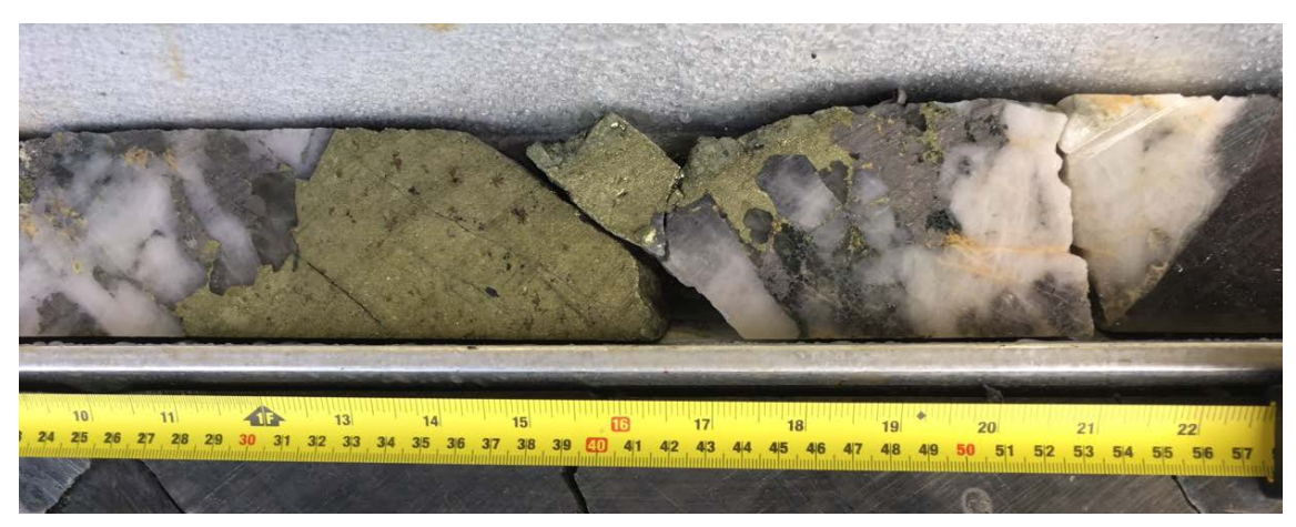
Chalcopyrite-rich vein, drillhole CRD022, 449.31 m