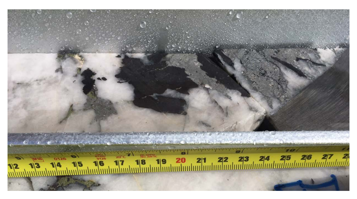
Wolframite in SVS quartz vein, drillhole CRD022, 432.40 m