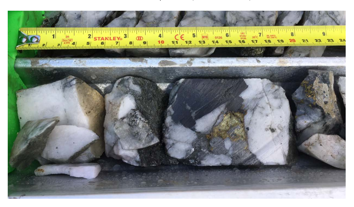
Coarse wolframite in SVS quartz vein, drillhole CRD022, 410.70 m