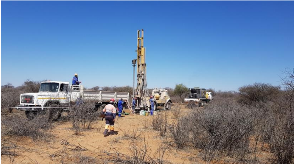
Plate 1 - RAB drilling at the Korong Nth (KM1) Prospect