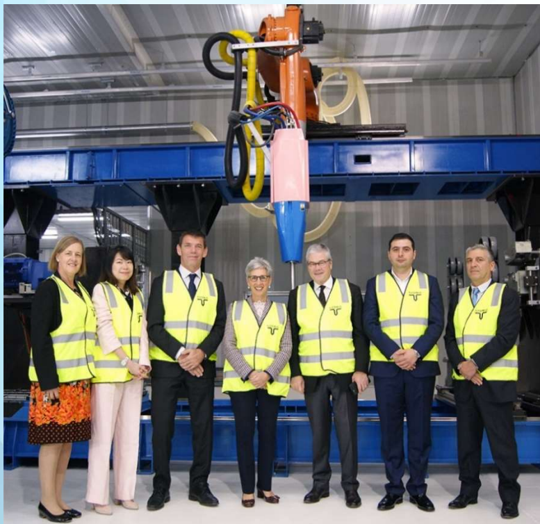
Representatives from CSIRO and Titomic with The Hon. Linda Dessau AC, Governor of Victoria.

Launched in May this year, Titomic continues to accrue and establish owned Science Technology Engineering Mathematics (STEM) capabilities such as in-house robotics programmers, machinists and R&D engineers to develop a self-sustained R&D Production Centre.