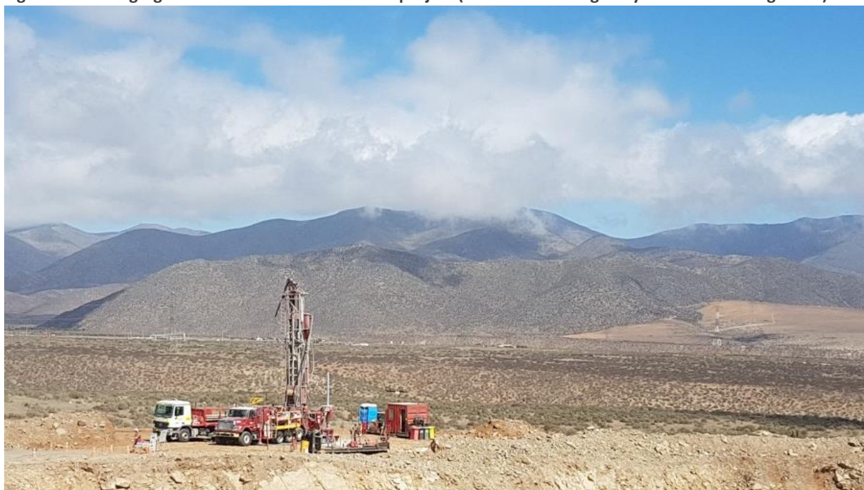
Figure 1 – Drilling rig commences at Yerbas Buenas project (Pan American Highway 2km in the background)

Figure 3 shows the relative positions of the YB1, YB3 and YB6 magnetic structures that are being drilled.