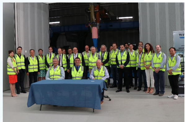
Titomic stakeholders and well celebrate the acquisition of the two pipe patents