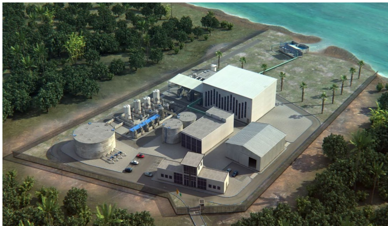
CAD depiction of plant location and layout.

“This project is of key importance for the city of Abidjan and the country as a whole,” noted Ivory Coast’s Minister of Water, The Honourable Laurent Tchagba. “We are pleased with the deep expertise of the Fluence team, not only for developing a solution for this source of water and arranging export credit financing for the project, but also for its capability in executing an infrastructure project of this magnitude that is critical to the future growth of Ivory Coast.”