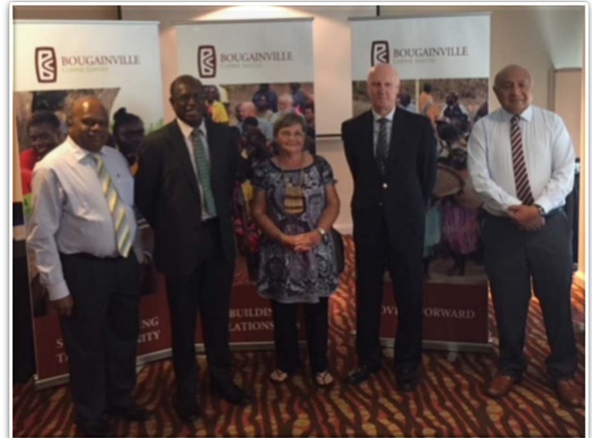
Board members at the 2017 Annual General Meeting