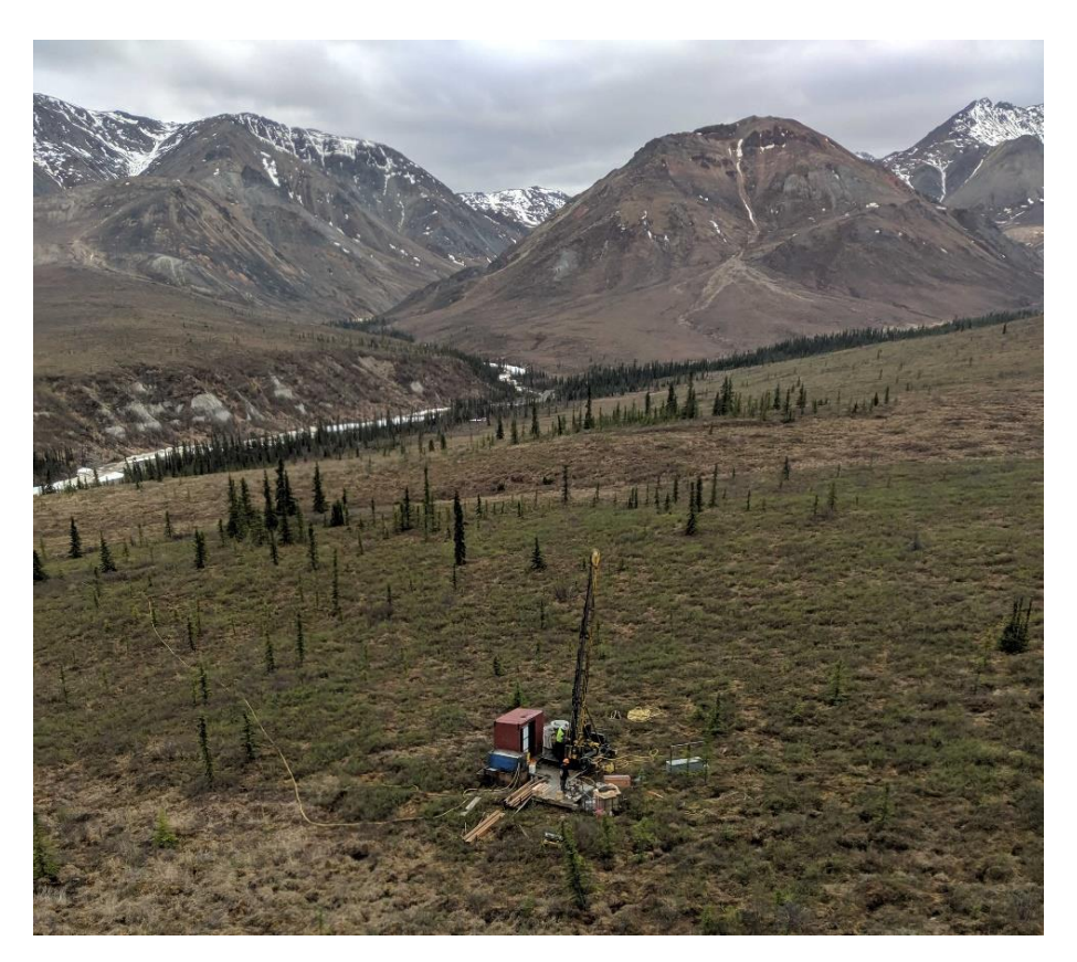
Figure 2: Diamond drill rig set-up 2km west of the WTF deposit, looking south towards Red Mountain.